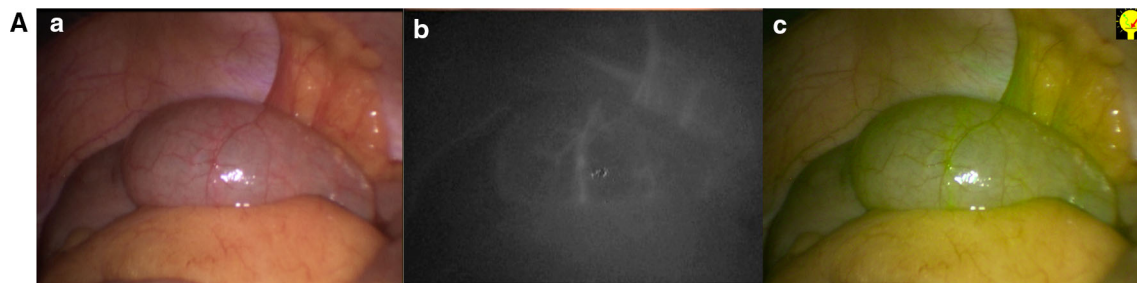
Fig. 3 Positive control. a Normal light. b Near-infrared fluorescence. c Superposition of NIR and normal light in green. A Image of the normal cecum after IDC injection