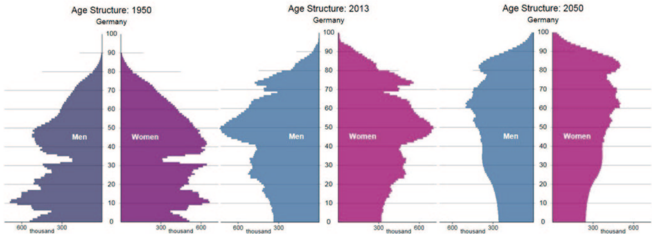
Fig. 1 Demographic development of the German population from 1950 to 2013 and estimated development until 2050. The number of people above the age of 65 years is increasing relatively and absolutely in the total population (Statistisches Bundesamt 2009).

rent data on stroke treatment, the authors advocate the role of the endovascular approaches in the future.