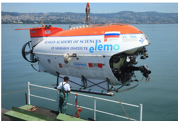
Fig. 1 MIR submersible from the PP Shirshov Institute of Oceanography, Moscow, of the Russian Academy of Sciences, ready to be launched in Vidy Bay, Lake Geneva, Switzerland. The submersible is driven by the large black propeller (left) and its 3-D trajectory is controlled by two small white propellers (center one on each side). Details of the equipment visible in front of the submersible (right) are given in Fig. 3.

Consequently, the opportunity of a lifetime was presented when the Consulat Honoraire de la Fédération de Russie, proposed to the Ecole Polytechnique Fédérale de Lausanne (EPFL) to bring the two world's most famous MIR submersibles to Lake Geneva (Fig. 1). The PP Shirshov Institute of Oceanography in Moscow, owner of the MIRs and the Fondation pour l'Etude des Eaux du Léman (FEEL) in Lausanne, agreed that the MIRs would make a total of 60 scientific dives in Lake Geneva from 14 June to 24 August 2011. The generous sponsoring by the Consulat Honoraire de la Fédération de Russie and the FEEL foundation allowed initiating and supporting the project elemo ( http://www.elemo.ch ) in order to take advantage of this unique opportunity. The emphasis was put on studies