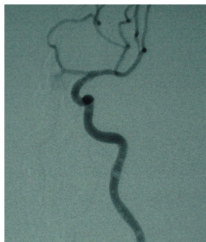
Fig. 2 Left internal carotid artery injection