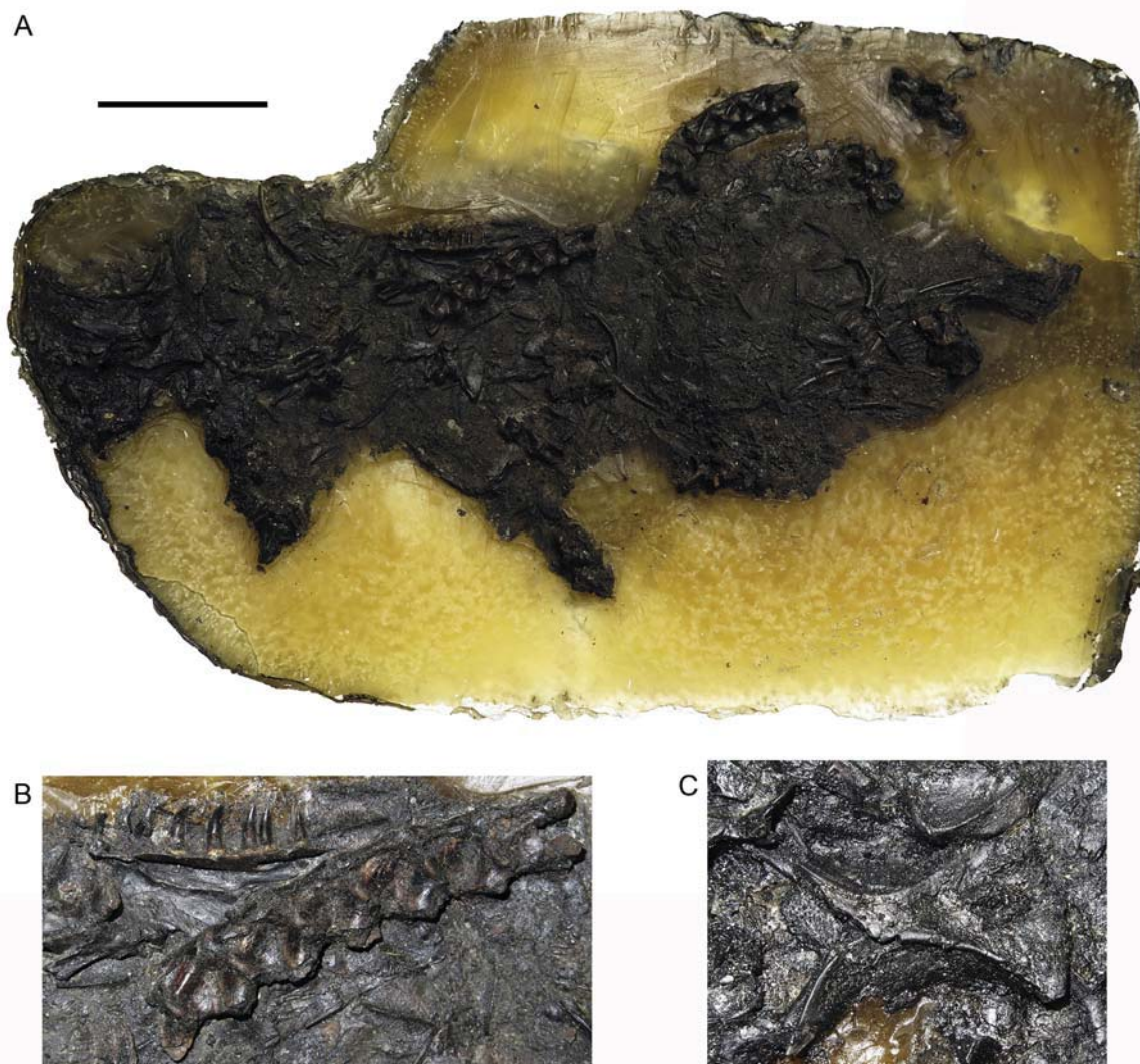
Fig. 4. Photograph of the holotype of Melanosauroides giganteus (GMH CellII-4139-1933) (herein Palaeovaranus giganteus) (A) from the middle Eocene of Geiseltal, Germany. Close up of the maxilla and associated vertebrae (B). Close up of the parietal (C). Scale bar = 5 cm (for A). Photographie de l'holotype de Melanosauroides giganteus (GMH CellII-4139-1933) (dans le présent travail: Palaeovaranus giganteus) (A) l'Éocène moyen de Geiseltal, Allemagne. Gros plan du maxillaire et des vertèbres associées (B). Gros plan du pariétal (C). Barre d'échelle = 5 cm (Pour A).