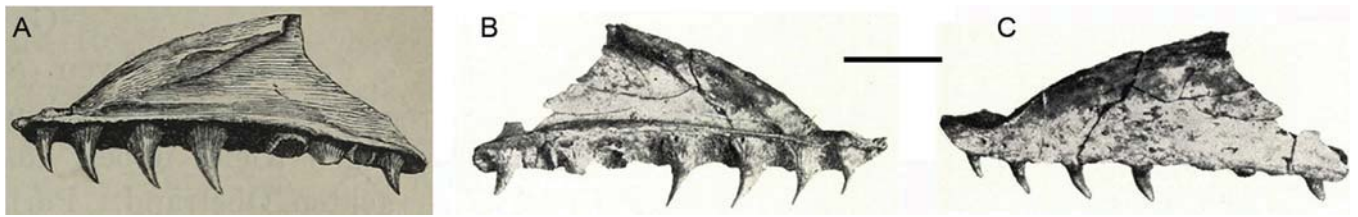
Fig. 2. The holotype of Palaeovaranus cayluxi (originally kept in BSPG, now probably lost) as being figured in the original lithograph of Zittel (1887–1890) (A) and the photograph of Fejérváry (1935) (B), (C). Note that the specimen in (A) seems like a right (and not left) maxilla, but it is in fact the reverse image, as is the common practice in lithography. (A), (B) represent the lingual view and (C) represents the labial view. Scale bar = 1 cm, adapted according to Fejérváry's (1935) measurements. L'holotype de Palaeovaranus cayluxi (initialement conservé au BSPG, probablement perdu maintenant), tel qu'il est figuré dans la lithographie originale de Zittel (1887–1890) (A) et la photographie de Fejérváry (1935) (B), (C). Noter que le spécimen en (A) semble être un maxillaire droit (et non gauche), mais c'est en fait une image inversée, pratique courante en lithographie. (A), (B) représentent la vue linguale et (C) représente la vue labiale. Barre d'échelle = 1 cm, adaptée selon les mesures de Fejérváry (1935).