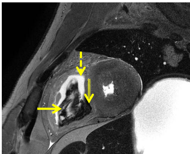
Fig. 1 Postmortem clotting. T2w cardiac short axis image presenting distended postmortem clotting within the right ventricle ( solid arrow ). Postmortem clots are heterogeneous in signal and appear free-floating within the greater blood-filled cavities at the sedimentation level between hyperintense serum ( dashed arrow ) and hypointense erythrocytes ( doubled arrow )

Natural causes of death are decreasingly autopsied in clinical pathology and the non-forensic clinical autopsy numbers keep declining. The effects on the quality of national mortality statistics, quality control in medicine and medical education are discussed manifold [13–15]. Efforts to counteract this unfavourable trend have remained unsuccessful so far and clinical autopsy is vanishing. In the present study, the cause of death was established before autopsy as already described for cardiac causes of death [4, 5]. The authors would like to recommend the usage of pmMRI in non-forensic circumstances especially when myocardial infarctions, pulmonary thrombembolism, intracerebral haemorrhages or comparable findings are of interest. Particularly hospital deaths without subsequent autopsy could be understood better by performing postmortem radiology, especially pmMRI. This would help to reduce the