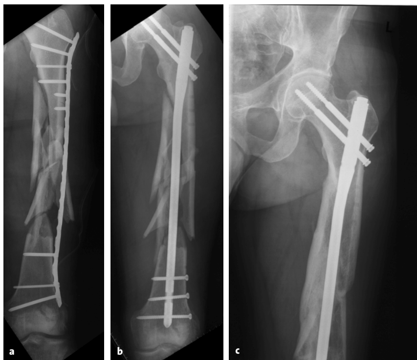
Figures 4a to 4c. X-rays of the left multiply fractured femur of a severely injured patient after stabilization with a locking compression plate (LCP) as internal fixator through small incisions (a), after definitive stabilization with an antegrade femoral nail (b), and 1 year after trauma with complete consolidation of the fracture (c).

A common, serious, and often insidious complication of abbreviated laparotomy is the ACS with progressive oliguria and advancing hypoxemia [1, 26, 30]. The most accurate and simple method to detect an evolving ACS is measuring bladder pressure via the Foley catheter [1, 26, 30].