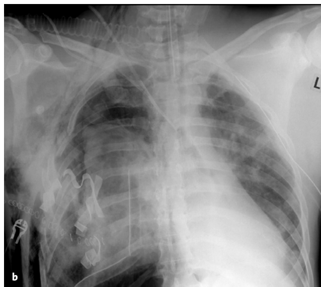
Figures 2a and 2b. Chest X-ray of a multiply injured patient with flail chest at admission (a) and 24 h after right anterolateral thoracotomy with packing of the thoracic cavity (b).