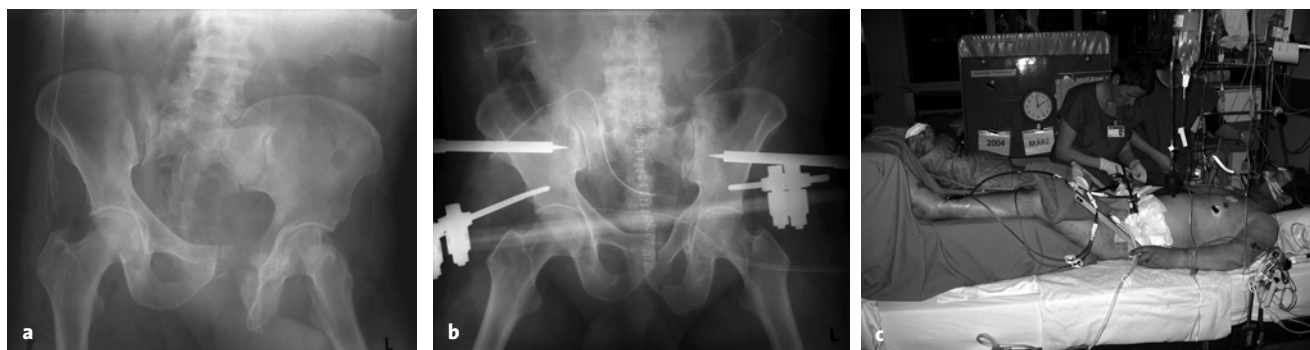
Figures 3a to 3c. Plain films of the pelvis of a multiply injured patient with vertical shear injury of the right side preoperatively (a) and postoperatively (b) after application of a pelvic clamp and external fixator as well as pelvic packing and abdominal vacuum-assisted closure after laparotomy. Physiological restoration of the patient in the ICU (c).

drains and packing. Urethral and bladder injuries of unstable patients are managed temporarily with splinting and/or suprapubic urinary diversion [1].