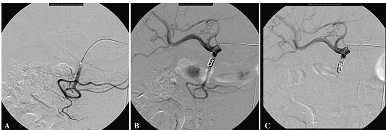
Fig. 2 Coiling phases of GDA. A Localization of the appropriate coiling segment. B Angiogram performed 5 min after HydroCoil implantation still shows flow; however, a flow reduction is already

From the 25 patients who underwent protective GDA embolization before SIRT, the planned SIRT was canceled in 2 patients (8%) as a result of progressively impaired liver