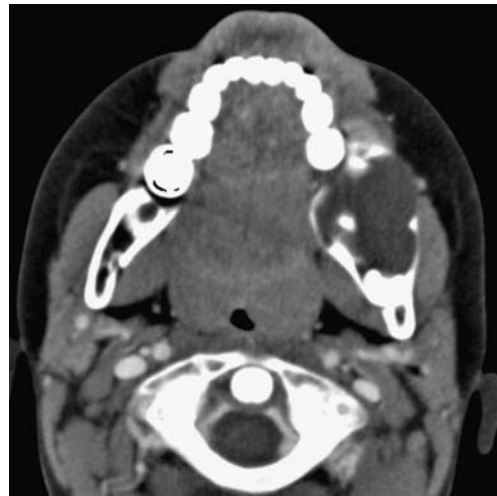
Fig. 2 Contrast-enhanced CT image