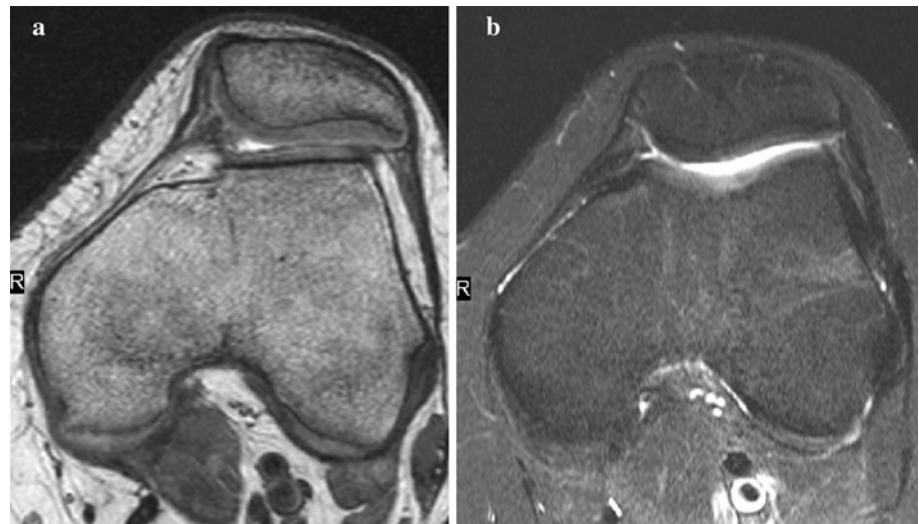
Fig. 5 a Preoperative axial MR slice showing the severe dysplasia. b Postoperative axial MR slice showing the corrected trochlear groove

Kujala score had no correlation with the postoperative score and imaging. Postoperative pain correlated with the postoperative Kujala score ( r = 0.814 ; P < 0.001 ), postoperative subjective knee value ( r = 0.729 ; P < 0.001 ), the postoperative satisfaction ( r = 0.76 ; P < 0.001 ) and the VAS maximal ( r = 0.741 ; P < 0.001 ). There was no correlation between the postoperative pain and the preoperative clinical or radiological findings.