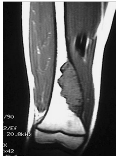
Fig. 7 On T1-weighted MR, the mass appeared hypointense but the surrounding rim of the lesion was of high signal intensity. The lesions had the same signal intensity as skeletal muscle

mitoses were scarce. Cholesterol clefts and haemosiderin deposits were seen in some cases, and reparative new bone formation was occasionally present. In all cases, the histological characteristics did not make it possible to make the distinction between non-ossifying fibroma and benign fibrous histiocytoma.