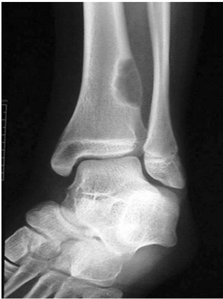
Fig. 1 A 14.7-year-old boy presented with pain of his left ankle for more than 3 months. Plain radiographs demonstrated an eccentrically located and expansile radiolucent lesion in the metaphyseal of the distal end of the tibia. The cortex was thinned and the lesion had a prominent marginal sclerosis with a ground-glass appearance