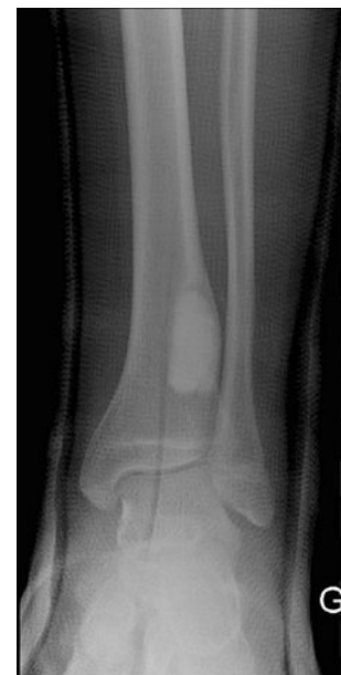
Fig. 4 Intralesional curettage was performed and phosphocalcic cement was employed for filling the osseous defect

The histological features of the six cases were similar, even if the relative proportions of the various elements differed. The tumour consisted of spindle cells, fibroblasts and histiocytic