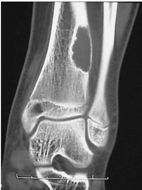
Fig. 2 CT scans showed an irregular lytic area with well-defined surrounding sclerotic bone