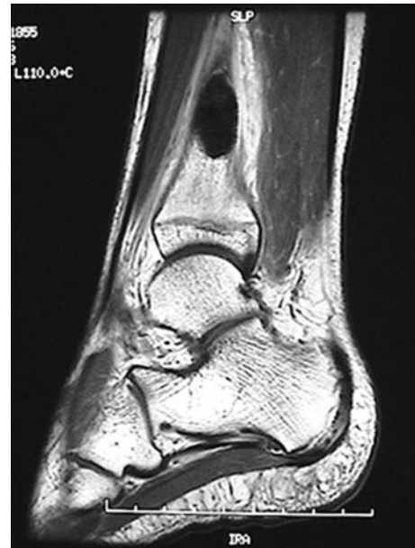
Fig. 3 On T1-weighted MR, the mass appeared hypointense, but the surrounding rim of the lesion was of high signal intensity