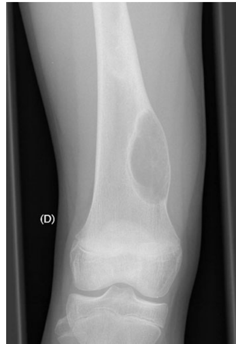
Fig. 12 The lytic lesion grew progressively and was suspected to be a giant cell tumour. Repeated intralesional curettage 2 years after the initial surgery was performed. As GCT was excluded by peri-operative biopsy, filling of the osseous cavity was carried out with phosphocalcic cement. Histologically, the tumour was composed of loose spindle cell proliferation intermixed with foam cells. The diagnosis of BFH was given because of the clinical presentation, the radiological features noted and recurrence of the lesion after the initial surgery

[6, 8, 10]. Clinically, non-ossifying fibroma is most of the time asymptomatic except in the case of pathological fracture [6, 8, 9], whereas benign fibrous histiocytomas frequently come to notice because of pain, usually of some months duration [3, 6, 7]. As non-ossifying fibromas spontaneously regress with skeletal maturity, surgical