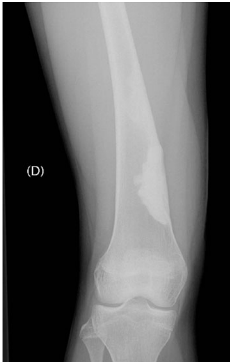
Fig. 13 Thirty-nine months after the second surgical procedure, the situation appeared stabilized

between BFH and non-ossifying fibroma. At our opinion, the diagnosis of BFH is probably underestimated among patients less than 20 years old. Therefore, this diagnosis should be considered, in our opinion, for any child or teenager who presents radiologically a non-ossifying fibroma accompanied by unexplainable pain or when the lesion grows quickly. The differential diagnosis of this lesion includes other clinical and pathological entities such as fibrous dysplasia, chondromyxoid fibroma, giant cell tumour of bone, eosinophilic granuloma, malignant fibrous histiocytoma, metastatic renal cell carcinoma, Erdheim-Chester disease or hyperparathyroidism. In adolescents and young adults, one of the most difficult differential diagnoses of BFH of metaphyseal-epiphyseal origin is giant cell tumour [9]. The starting point of GCT is always metaphyseal, and the lesion seldom extends to the epiphysis before osseous maturity. GCT is rare in children and adolescents less than 15 years old, in particular when the cartilage is still active. GCT may have histological features which are identical to those of benign fibrous histiocytoma; in these cases, the diagnosis is usually established only on the presence of small foci of typical histological patterns of giant cell tumour of the bone [6, 9]. Therefore, one should always keep in mind the small possibility of GCT of bone if the lesion arises at the end of long tubular bone, even if the patient is younger than 20 years of age.