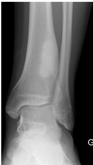
Fig. 5 Thirty-three months after surgery, bone healing was achieved with advanced phosphocalcic cement incorporation and no evidence of disease