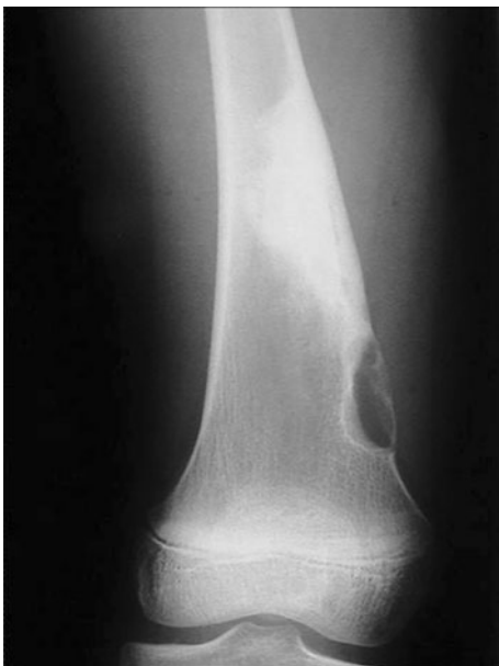
Fig. 11 However, 18 months after the operation, the patient presented with small, lytic, recurrent foci in the lower part of the old lesion

[6, 8, 10]. Clinically, non-ossifying fibroma is most of the time asymptomatic except in the case of pathological fracture [6, 8, 9], whereas benign fibrous histiocytomas frequently come to notice because of pain, usually of some months duration [3, 6, 7]. As non-ossifying fibromas spontaneously regress with skeletal maturity, surgical