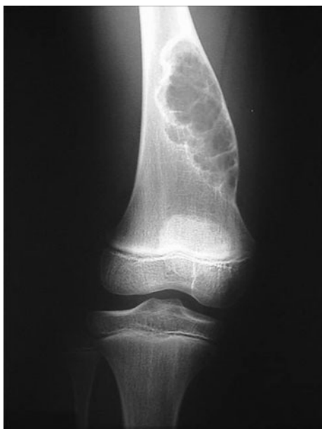
Fig. 6 A 10.75-year-old girl presented with pain and swelling around her right knee lasting 3 months. Physical examination disclosed a hard painful mass in the distal part of the right thigh . Plain radiograph showed a radiolucent lesion in the metaphyseal part of the femur with a soap-bubble appearance. The lesion was expansile, the cortex was thinned and showed prominent marginal sclerosis

mitoses were scarce. Cholesterol clefts and haemosiderin deposits were seen in some cases, and reparative new bone formation was occasionally present. In all cases, the histological characteristics did not make it possible to make the distinction between non-ossifying fibroma and benign fibrous histiocytoma.