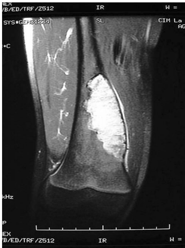
Fig. 8 The lesion turned hyperintense on T2-weighted images, with the surrounding sclerotic bone having low signal intensity

or diaphysis of tubular bones [5, 6, 8, 9, 11, 13, 17, 18]. In another reports, this tumour occurred particularly around the knee [6, 8, 9, 17]. There is neither periosteal reaction nor matrix mineralization [5–8, 10]. On conventional X-rays, the tumour may resemble non-ossifying fibroma, but BFH may have more prominent marginal sclerosis