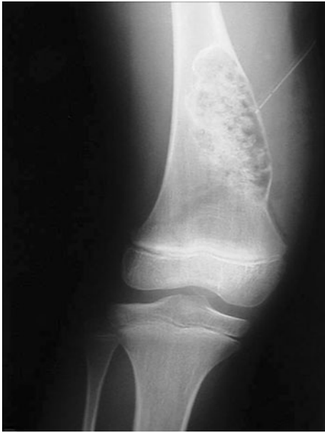
Fig. 10 Intralesional curettage was performed, followed by filling of the cavity with bank bone graft; the diagnosis of non-ossifying fibroma was evoked