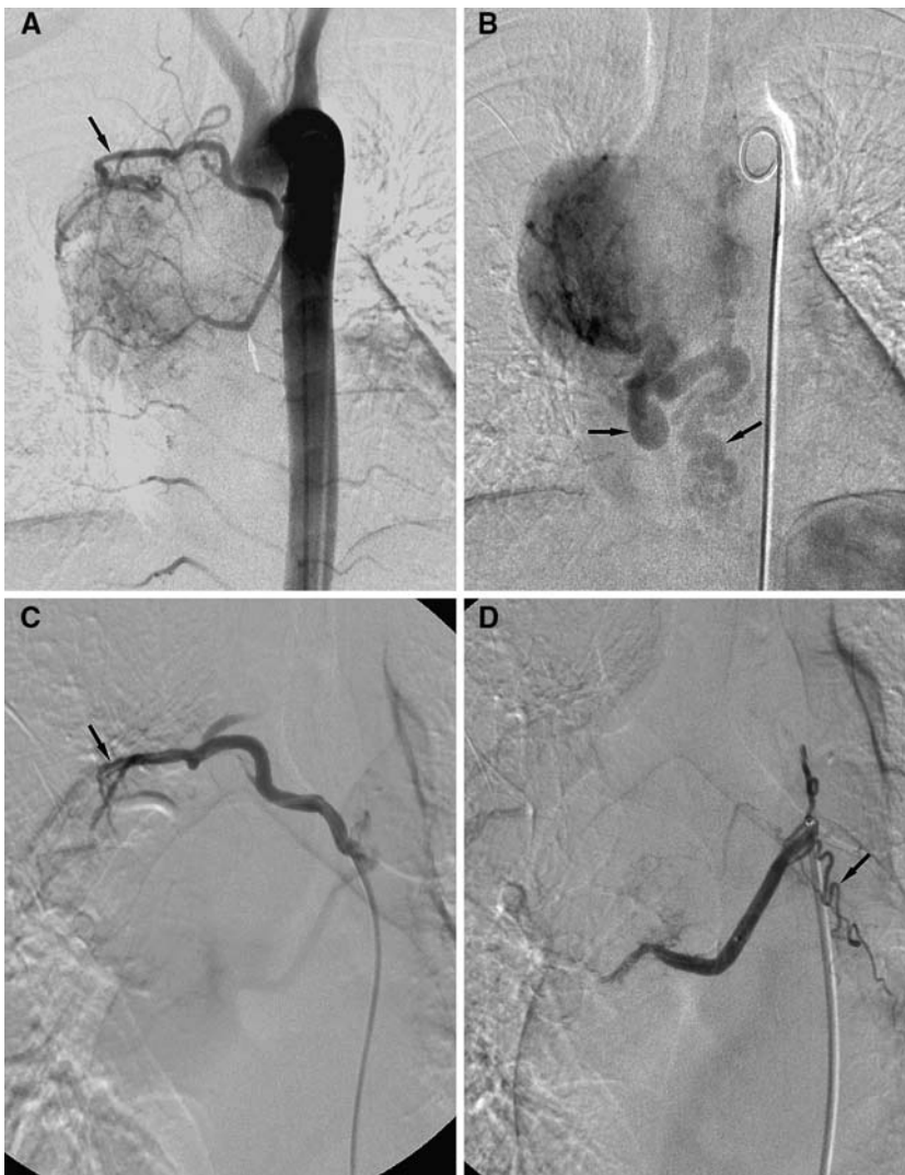
Fig. 2. Angiography prior to and following embolization. (A) Arterial phase of aortography shows the hypervascular mediastinal mass with two feeding arteries coming from a broncho-intercostal trunk: a superior and lateral branch (black arrow) and an inferior and medial branch (white arrow). (B) Venous phase of aortography shows the hypervascular mass draining in large uphill varices (black arrows). (C) Selective arteriography of the superior branch after embolization shows an occlusion of this vessel with small intraluminal defects (black arrow) corresponding to silk threads. (D) Selective arteriography of the inferior branch after embolization shows an occlusion of this vessel with preservation of mediastinal branches (black arrow). After embolization, the mediastinal mass is completely devascularized.

(mediastinal window) at the level of the right pulmonary artery shows a homogeneous and hypervascular mass with regard to soft tissues. The close relationship with the mass effect on the esophagus, right main bronchus and right pulmonary artery is particularly well demonstrated.