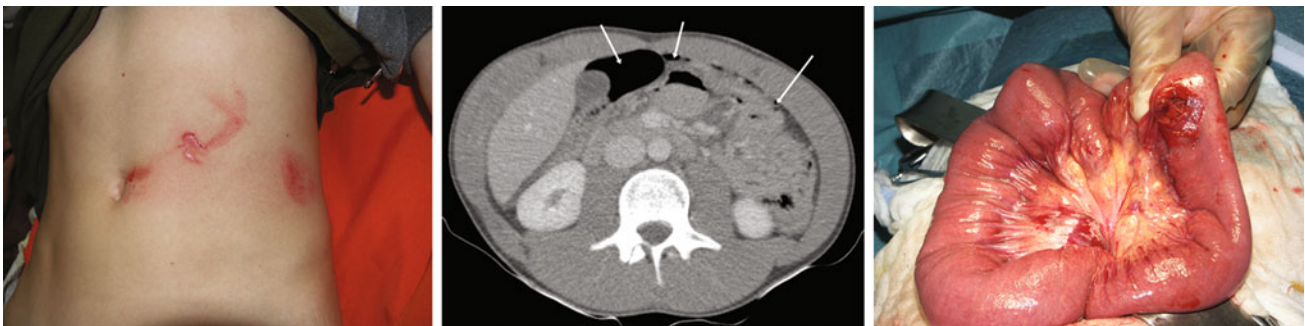
Fig. 3 15-year-old boy. Skin bruise after handlebar injury ( left ). Abdominal ultrasound revealed free retrovesical fluid and consecutive computed tomography ( middle ) showed free gas in the abdomen

herniation ( arrow ) through the abdominal wall ( middle ). Closure of the hernia was performed. The patient was discharged 4 days after surgery