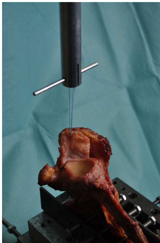
Fig. 1 Biomechanical test setting: The prepared scapula was set into a fixation device. Each suture was set 5 mm medial to the free lateral tendon margin. Sutures were securely fixed to a 1,000-N load cell of the material testing machine (Zwick-Roell, Ulm, Germany), forming a suture loop using 7 square knots. Ultimate load to failure test was performed at a rate of 1 mm/s

The rotator cable was identified on the articular side of the supraspinatus tendon and stitch positioning was determined. Precise stitch positions are depicted in Fig. 2. First four lateral sutures were set 5 mm medial to the free lateral tendon margin. The most anterior suture was set in the anterior part of the rotator cable; the three following sutures were positioned lateral to the rotator cable (lateral row: antero-central, postero-central, and posterior). Simple stitches, piercing the width of the tendon using a braided nonabsorbable polyblend UHMWPE suture (USP No. 2) (FibreWire, Arthrex Inc., Naples, FL), were used to minimize variability in technique. Sutures were securely fixed to a 1,000 N load cell, forming a suture loop using 7 square knots. Following separate load to failure tests for every single suture starting from anterior to posterior, the tendon end was resected leaving 5 mm of the rotator cable and the second suture row was placed. Three sutures were positioned (anterior, central and posterior) exactly medial to the