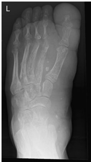
Fig. 1 DP radiograph of the left foot

A 32-year-old male patient with a known congenital syndrome was referred to our radiology department for work-up of persistent worsening foot pain over 4 weeks. No history of previous trauma was identified. Radiography and (for further work-up) MRI and CT examinations were performed (Figs. 1, 2, 3).