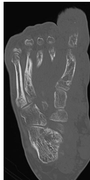
Fig. 3 CT, axial reformation of the left foot

The diagnosis can be found at doi:10.1007/s00256-011-1238-8