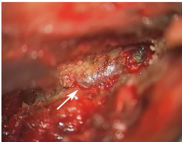
Fig. 4 Intraoperative image showing the bluish appearing encapsulated lesion, strongly adherent to the ligamentum flavum

improvement led to the presumptive diagnosis of a spinal tumor. The acute onset and slight improvement of symptoms could have been explained by an intratumoral hemorrhage. In our opinion, surgical treatment in this patient with partial initial improvement and the histological diagnosis of a chronic epidural hematoma should not be viewed as “avoidable” surgery because contrast-enhancement and stable residual symptoms made it impossible to rule out neoplasia as the underlying diagnosis. Additionally, other structural pathologies such as vascular malformations may be obscured by the hematoma at the time of initial imaging. Therefore, in the reported case, surgical management did not only provide immediate symptomatic relief but also allowed achievement of a histological diagnosis and thereby ruling out neoplasia or vascular malformation as the underlying cause.