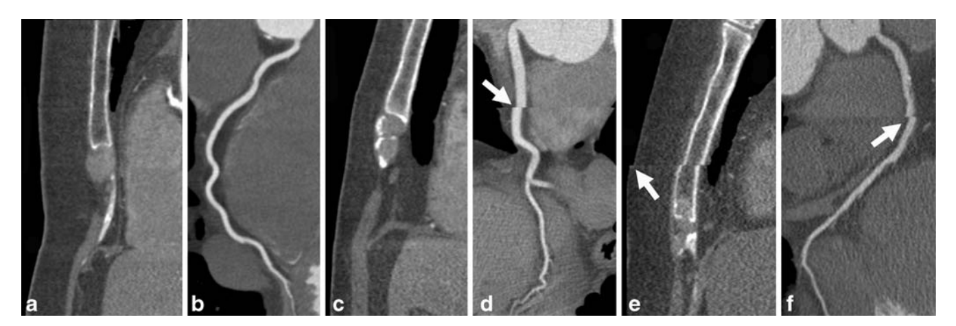
Fig. 1 Sagittal reformations of the thoracic wall ( a , c and e ) and curved multiplanar reformations of the right coronary artery ( b , d and f ) in three different patients. a and b demonstrate perfect alignment of the thoracic wall and of the coronary arteries in a patient with a mean heart rate of 59 bpm, a heart rate variability of 1.0 bpm, a BMI of 23.4 kg/m<sup>2</sup> and a weight of 62 kg. c and d demonstrate perfect alignment of the thoracic wall, but a stair-step artefact (maximum offset 2.6 mm, arrow ) in the CTCA of coronary

considered to indicate statistical significance. SPSS software (SPSS 15.0, Chicago, ILL, USA) was used for statistical testing.