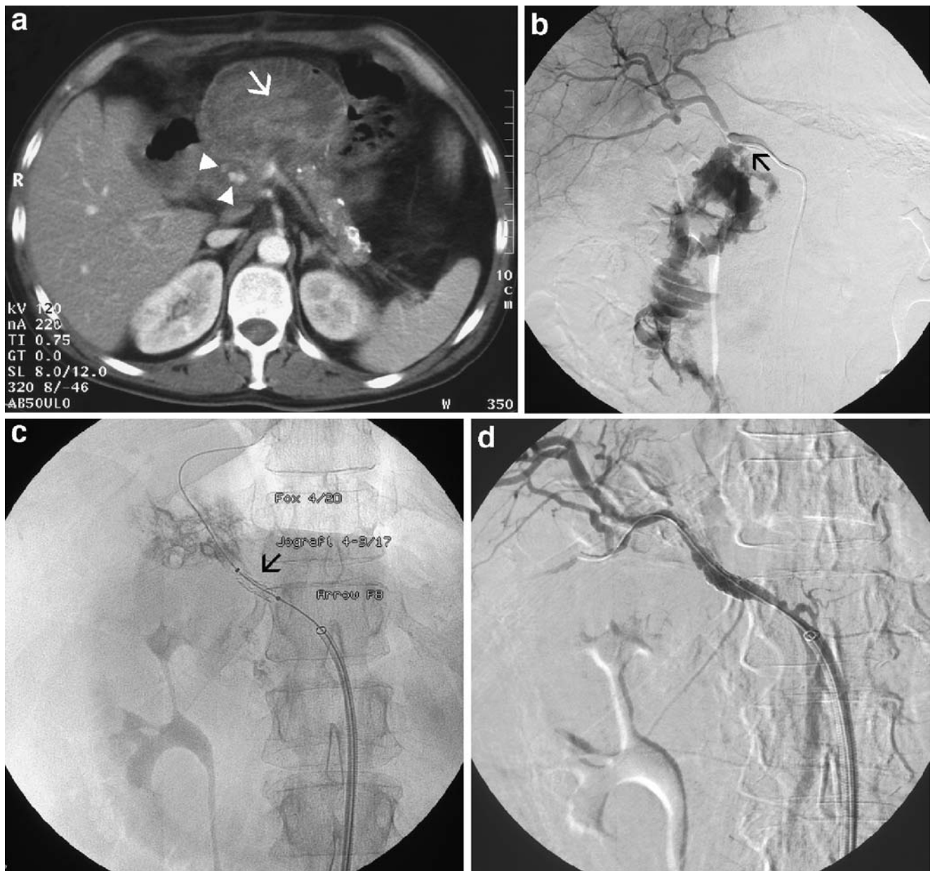
Fig. 1 A 50-year-old patient with suspected bleeding 18 days after duodenum-preserving pancreatic head resection. a: Contrast-enhanced CT of the upper abdomen demonstrates changes of chronic pancreatitis with foci of calcification in the pancreatic body and tail. Anterior to the pancreas there is a dilated loop of small bowel, filled with material of high attenuation (arrow), which was also seen on the non-enhanced scan (not shown), compatible with coagulated blood. In the anatomic area of the resected pancreatic head, contrast enhancing “spots” (arrowheads) are evident. b: Selective angiography of the common hepatic artery demonstrates massive contrast

agent extravasation in the anatomic area of the gastroduodenal artery marked by the titanium clip (arrow) with consecutive filling of the Roux-en-Y bowel loop, revealing the typical jejunal folds. c: Stent graft placement (Jostent graft) with the over-the-wire technique through an Arrow F8 sheath placed close to the arterial leak, in the hepatic artery. Note the 5F Fox 4/20 mm balloon catheter within the stent graft (arrow) for postdilatation. d: Completion angiography after Jostent graft placement demonstrates regular flow within the patent hepatic artery and its branches. No evidence of bleeding as compared to the initial angiography