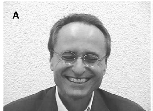
Fig. 1 Two stills of the video stimuli: a laughing and b yawning

To assess "psychopathology" in healthy controls we used the SPQ overall score (0-74) [44] assuming that