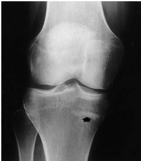
Fig. 2 Frontal radiograph of the right knee 3 months after the onset of acute atraumatic knee pain with an area of sclerosis in the proximal medial tibial plateau ( arrow )

proximal medial tibia ( white arrow ) and an insufficiency fracture line ( thin black arrow ). C Sagittal T2-weighted image (TR: 4000, TE: 96) shows the insufficiency fracture ( arrow )