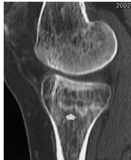
Fig. 3 Computed tomographic sagittal reformatted image shows again the insufficiency fracture ( arrow )

excessive alcohol intake reported. As the patient had no history of trauma or of overuse, dual-energy X-ray absorptiometry (DXA) was performed (Hologic QDR 4500c, Hologic, Bedford, Mass.). Low bone mineral density (BMD) was found at the lumbar spine (L3: 0.954 g/cm 2 , T -score -1.2 SD, Z -score -1.2 SD), the contralateral femoral neck (0.727 g/cm 2 , T -score -1.1 SD, Z -score -0.9SD) and distal tibial epiphysis (0.623 g/cm 2 , T -score -1.5 SD, Z -score -1.3 SD). Metabolic investigation showed diminished urinary calcium, normal blood calcium levels (ionized and total), a blood phosphate concentration at the upper limit of normal, and normal levels of 25-hydroxyvitamin D, parathyroid hormone (intact PTH), osteocalcin and a normal urinary deoxy pyridinoline/creati-