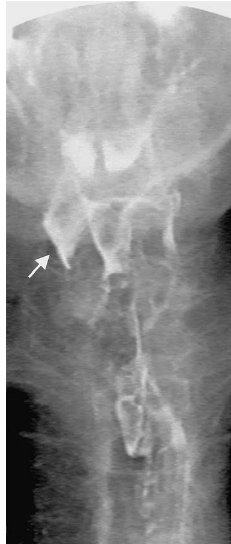
Fig. 2. Anterior view of dynamic videofluoroscopy illustrating unilateral pharyngeal wall dysfunction with residue in the right-side pyriform sinus. The pharyngeal wall on the damaged side enables the enlargement of the pyriform sinus (↑).

After surgery the patient was mobilized without a collar. A postoperative lateral plain cervical spine radiograph demonstrated complete removal of all HACO from C3 to C7. Initial postoperative videofluoroscopy at one month showed absence of pharyngeal peristalsis and laryngeal elevation with aspiration. Three months after surgery, fiberoptic laryngoscopy demonstrated normal mobility of both vocal folds without any bronchoaspiration and oral feeding was introduced progressively. Seven months after surgery, the patient had a closed tracheotomy tube for 72 h and it was removed without further respiratory problems. The patient is still symptom-free three years after surgery.