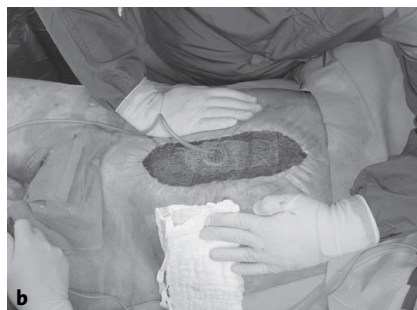
Figures 4a and 4b. a) V.A.C.® Abdominal Dressing System before suction is started. b) Suction is started and the foam collapses.