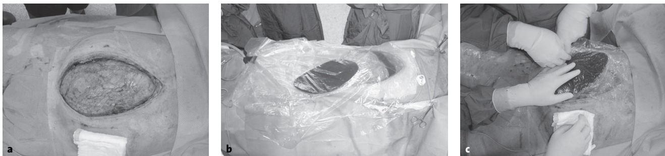
Figures 1a to 1c. a) Open abdomen. b) Perforated polyethylene sheet with a thin polyurethane sponge encapsulated in the center. c) The sheet is tucked under the wound edges to prevent adhesion of the viscera to the peritoneum.

The commercially available V.A.C.® Abdominal Dressing System (KCI Vacuum Assisted Closure) consists of a thin black polyurethane foam encapsulated in the center of a perforated polyethylene sheet, a separate black polyurethane foam, a suction drain and of adhesive drapes. The sheet is cut to an appropriate dimension, placed over the viscera and tucked under the wound edges (Figure 1). A second black polyurethane foam, cut to fit the wound, is placed over the embedded plastic sheet with the thin foam. If necessary, the foam is fixed to the skin edges with staples (Figure 2). The surrounding skin is cleaned with benzine, and adhesive dressing drapes are trimmed as a patchwork to seal the wound. A hole of 2 cm diameter is cut out in the drape, the TRAC-PAD® (KCI Vacuum Assisted Closure) is positioned on this occlusive seal (Figure 3) and connected with a vacuum pump (KCI