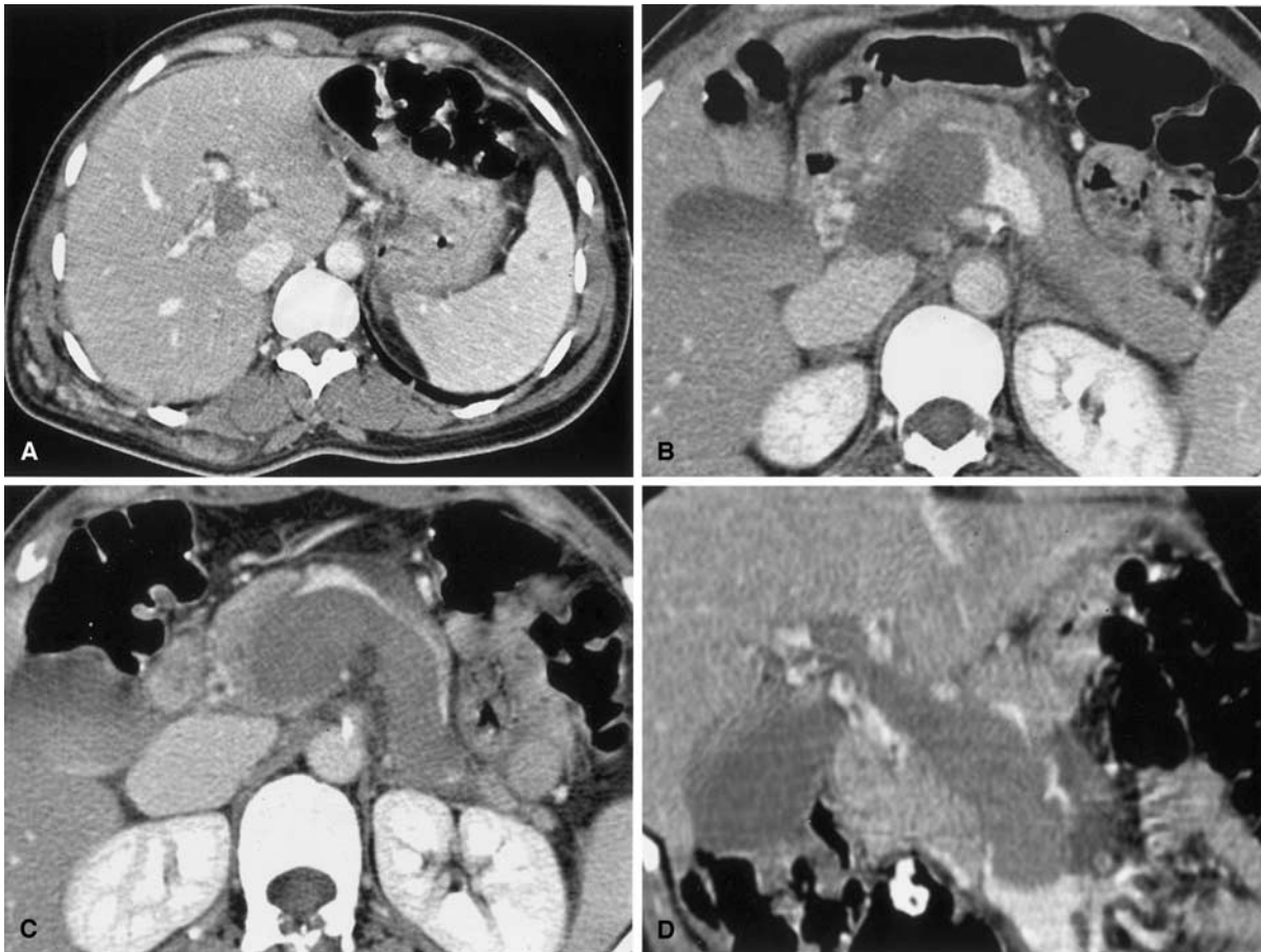
Fig. 1. Transverse CT scans showing occlusion of the portal vein bifurcation (A), the confluence sinus (B), and the aneurysmatic superior and inferior mesenteric vein (C). Multiplanar reconstruction

SMV, superior mesenteric vein; SV, splenic vein