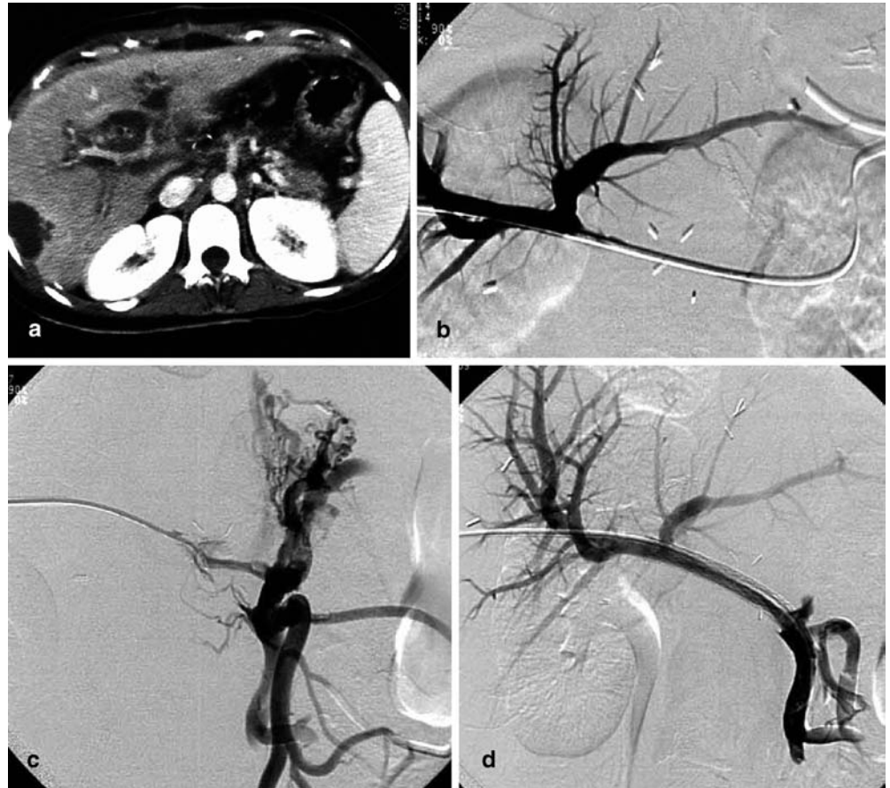
Fig. 2a–d A 45-year-old patient suffers from recurrent variceal bleeding 3 months after orthotopic liver transplantation (OLT). a Contrast-enhanced CT at the level of the liver hilum demonstrates small intra-hepatic branches associated with periportal edema. b Portography performed by a trans-hepatic route shows complete obstruction of the portal vein in the hilum. c After recanalization, angiogram performed upstream shows dilated superior mesenteric vein and reversed inferior mesenteric vein. d After stent placement, the flow is now rerouted in the recanalized portal vein. Note that the inferior mesenteric vein is no longer reversed

ing since the graft portal venous segment is short and necessitates the use of interposition graft. These grafts increase significantly the risk of portal vein complication [31]. Diagnosis of portal vein stenosis can be achieved in pediatric patient by US Doppler when the portal vein diameter is below 2.5 mm in diameter and a when a jet flow is visible in color Doppler at the stenotic site [32]. In adult population, the criteria are a corrected velocity superior to 1m/s or threefold of the velocity upstream in the portal vein [33].