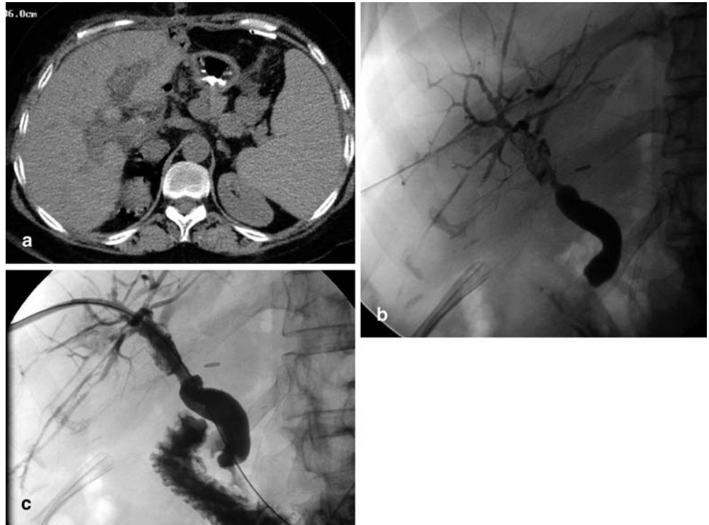
Fig. 4a–c A 48-year-old patient transplanted 6 months previously is readmitted for recurrent jaundice episode. a Plain CT demonstrates hyperdense material within the biliary confluence. b Percutaneous cholangiography demonstrates no dilatation of the intrahepatic bile duct despite the filling of the biliary confluence by occlusive casts associated with a stenosis of the biliary anastomosis. c Cholangiogram obtained 1 year later