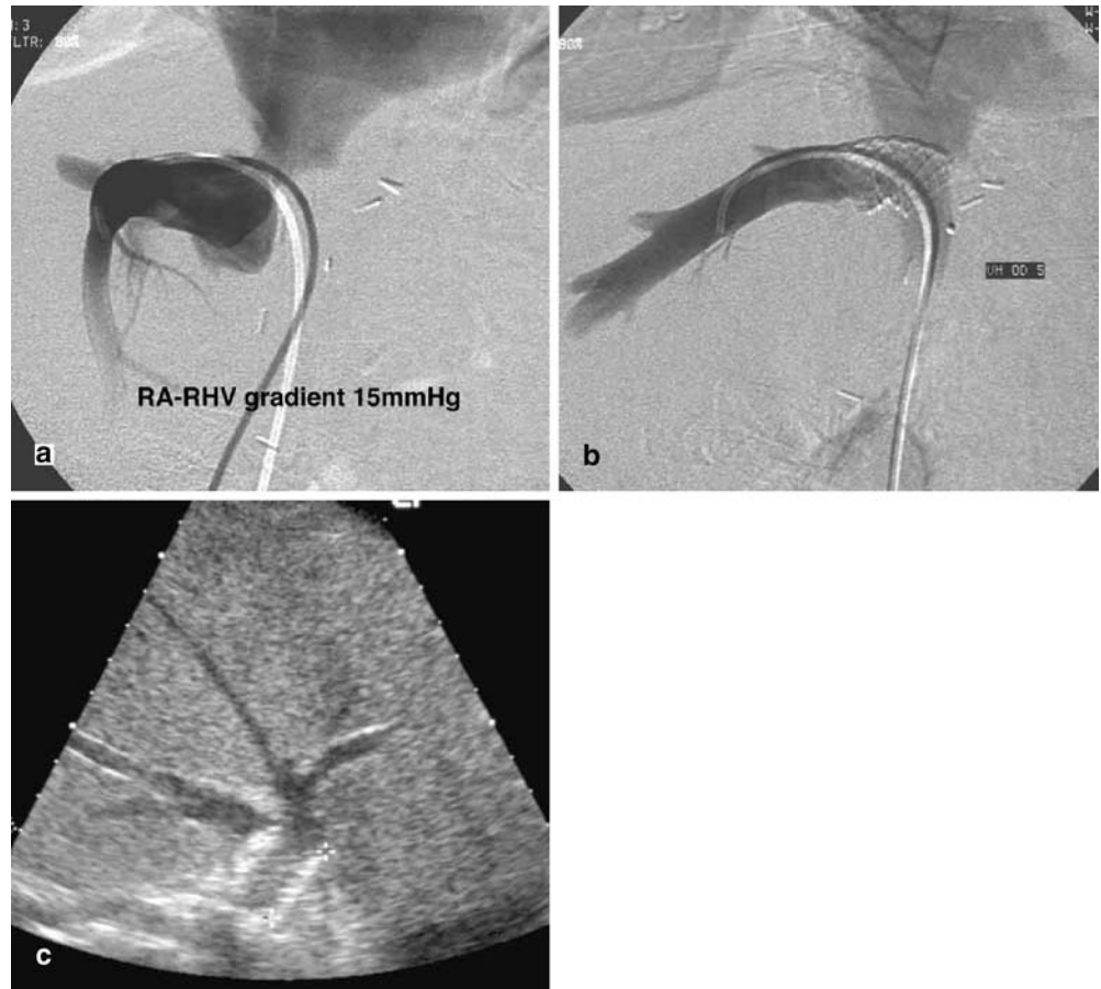
Fig. 3a–c A 56-year-old woman was readmitted for persistent medicoresistant ascitis 1 month after OLT. a Hepatic phlebography and pressure-gradient measurement shows stenosis of the cavo-caval anastomosis with a high-pressure gradient. b After stent placement, the gradient has disappeared. c Ultrasound of the hepatic vein ending demonstrates a patent stent over the stenosis 3 years after treatment

venous outflow obstruction is higher and reported in up to 3.9% [44]. Hepatic outflow obstruction can be related either to a preexistent venous disease, such as in patients with Budd-Chiari syndrome, or in children with biliary atresia. Surgeons there need to perform atypical caval anastomosis which are more prone to delayed complication. The other category is venous anastomotic stricture. Symptoms are similar to a Budd-Chiari syndrome with ascitis and graft failure. This complication can be recognized with certain delay, because in patients who were transplanted for chronic liver disease and ascitis, ascitis can persist for a few weeks after OLT and preclude diagnosis of venous complication.