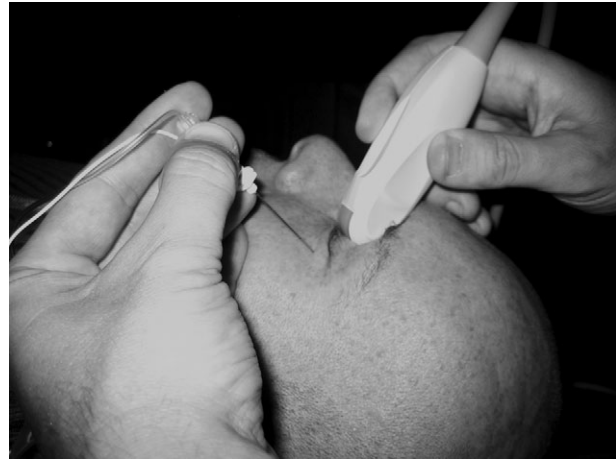
Fig 1 The curved array ultrasound transducer is placed at the upper and inner quadrant of the orbita. The needle penetrates the skin at the lower outer quadrant in line to the transducer. (Picture taken on a model instead of a cadaver).

Two examiners (R.G. and U. E.) performed ultrasound-guided retrobulbar blockade. In each cadaver, the right and the left eyes were randomly assigned to the examiners. The ultrasound device used was a SonoSite® MicroMaxx (SonoSite Inc., Bothell, WA, USA) with an 11 MHz curved array transducer (C11e, 8–5 MHz, 11 mm broadband curved array, SonoSite Inc.). The ultrasound transducer was placed in the upper and inner quadrant of the orbita (Fig. 1) and transverse sonogram obtained showing the bulbus and the optic nerve (Fig. 2).