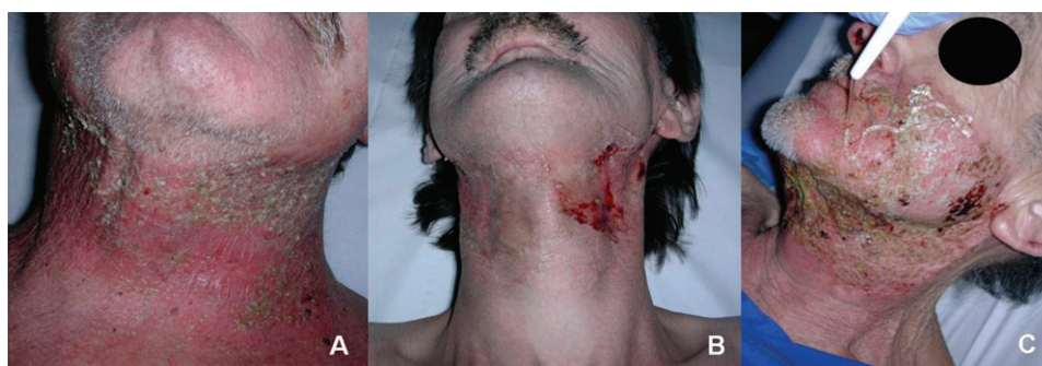
Figure 2. Examples of radiation dermatitis in three patients receiving cetuximab plus radiotherapy. (A) Modified grade 2 radiation dermatitis with non-hemorrhagic crusts. (B and C) Two examples of modified grade 3 reactions that could be overclassified using the NCI-CTCAE grading system. In B, bleeding is from <40% of the irradiated site and in C, hemorrhagic crusts cover <50% of the involved field. In C, hydrogel is being applied to the crusts. NCI-CTCAE, National Cancer Institute—Common Terminology Criteria for Adverse Events.