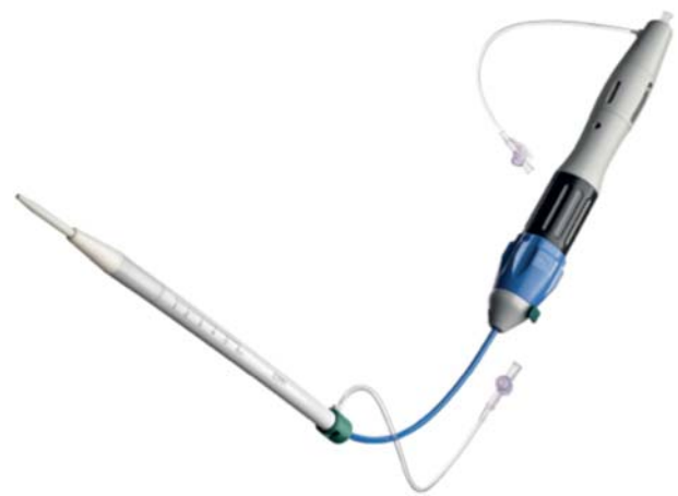
Figure 2: Redesigned flexible prosthesis delivery system with soft tip: loaded device before implantation.

The procedures were performed from September 2010 to July 2011. All procedures were performed in a surgical hybrid suite and with cardiopulmonary bypass on stand-by. The delivery system is composed of a 29Fr (inner diameter) introducer and a flexible delivery catheter with a 13Fr shaft, which form one integral unit (Fig. 2). Prior to the procedure, the valve was crimped and mounted onto the delivery system and handed pre-flashed to the operator. A temporary trans-venous pacemaker wire was inserted for rapid pacing. A 6Fr femoral arterial sheath was inserted into one femoral artery and a pigtail catheter was placed into the aortic root for contrast aortography. A 6F introducer sheath was inserted into one femoral vein and a guidewire placed in the right atrium to establish access for fast cannulation in case conversion to extracorporeal circulation became necessary (safety precaution). Low-dose heparin was given with a target activated clotting time of 250 s.