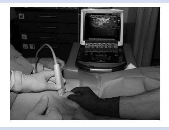
Fig 1 This image shows the block technique. The surgeon tightly holds the spermatic cord and lifts it for better visibility of the structures. The ultrasound transducer is applied transversally in relation to the course of the spermatic cord.

At each site, the spermatic cord was identified as a half-rounded structure surrounded by the external spermatic fascia and its contents. Inside the spermatic cord, the testicular artery was first identified by Doppler ultrasound. The deferent duct was easy to discern as a round non-compressible anatomical structure with no Doppler flow signal (Fig. 2). After a further disinfection of the puncture site, a 23G Microlance<sup>TM</sup> sharp needle (Becton Dickinson AG, Fraga, Spain) was inserted under out-of-plane real-time ultrasound guidance with the spermatic cord in short axis and directed towards the deferent duct, contralaterally to the testicular artery. The needle tip was advanced to direct contact with the deferent duct. That made it possible to visualize the local anaesthetic spreading around the