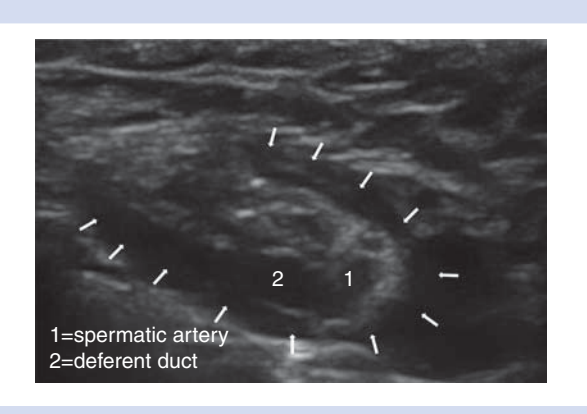
Fig 3 Spermatic cord after local anaesthetics (LA) injection. The arrows mark the hypoechoic appearing LA inside the spermatic cord, around, and between the spermatic artery and duct. 1, spermatic artery; 2, deferent duct.

deferent duct (Fig. 3). For the block, we used a mixture of 5 ml mepivacaine 2% (Institute of Pharmacology, University Hospital Berne, Switzerland) and 5 ml ropivacaine 0.75% (AstraZeneca AG, Zug, Switzerland). Each spermatic cord was anaesthetized with 10 ml of this mixture and the scrotal skin was infiltrated with the same anaesthetic mixture (in total 2–3 ml) at the site of the incision