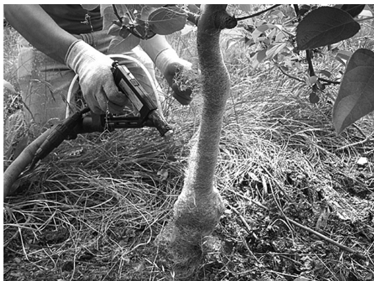
Fig. 2. Application of EVA barriers using a hot-melt spray gun, North Huron, NY.

planted in 2004, 4.2 cm trunk diameter at 30 cm height; Lummisville, mixed varieties on M.9 rootstock, planted in 2007, 3.7 cm trunk diameter at 30 cm height; Hilltop, mixed varieties primarily on B.9 rootstock, except for one variety (Braeburn) on M.26 rootstock, planted in 2002, 5.7 cm trunk diameter at 30 cm height.