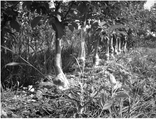
Fig. 1. Apple tree trunks covered by nonwoven EVA fiber barriers, North Huron, NY.

which entails considerable labor and potential for worker exposure.