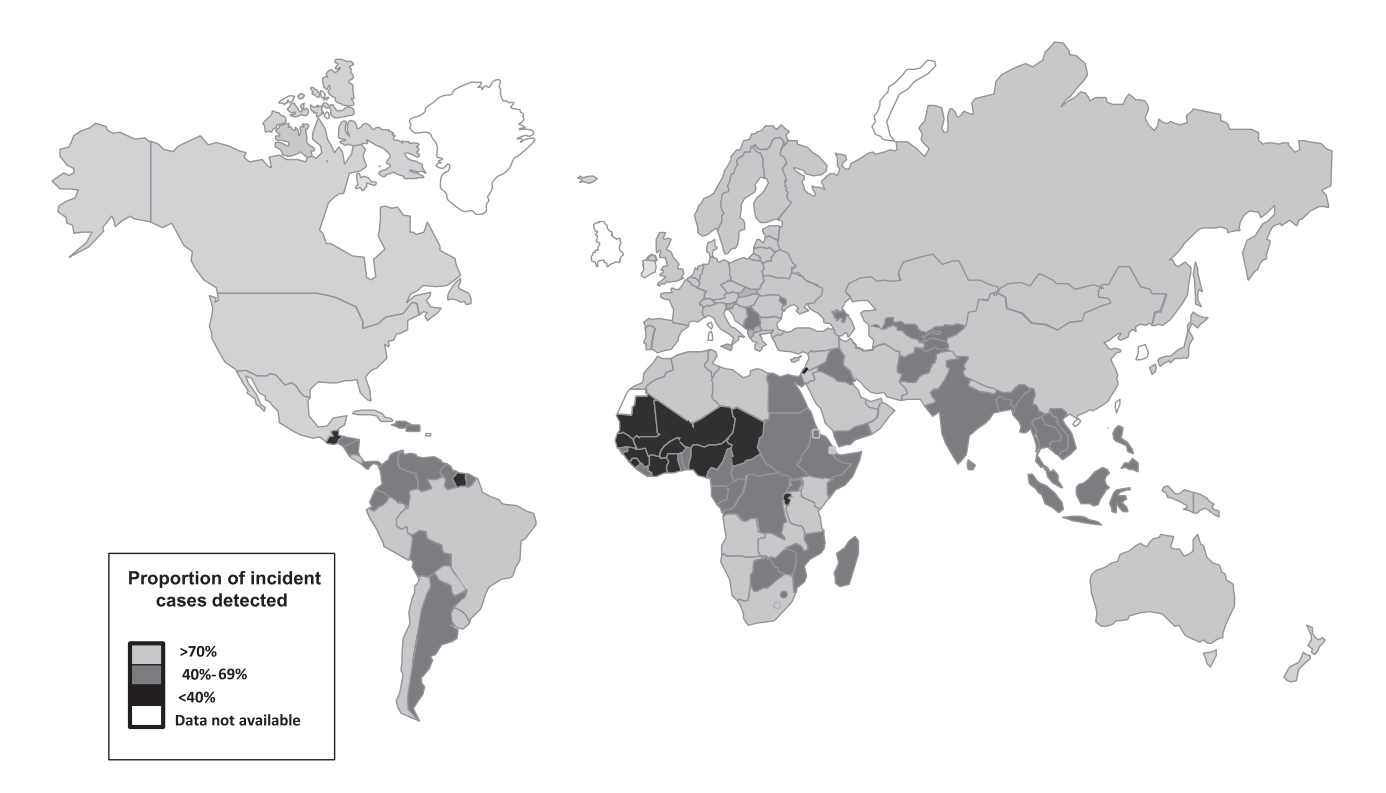
Figure 1. Estimated global tuberculosis case detection rates. Compiled from data presented in the Global Tuberculosis Control Report (WHO. Global tuberculosis control. Geneva: World Health Organization; 2010.).