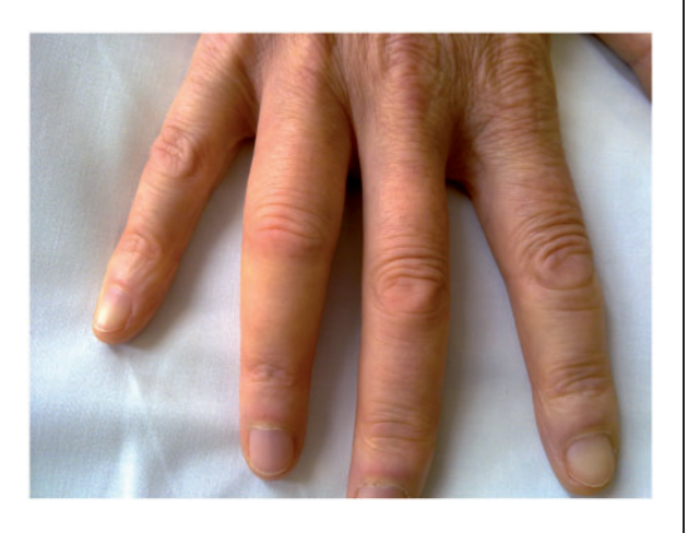
Fig. 1 Dorsal aspect of right hand showing swollen ring finger.

1 Dahl WJ, Jebson P, Louis DS. Sea urchin injuries to the hand: a case report and review of the literature. Iowa Orthop J 2010;30:153–6.