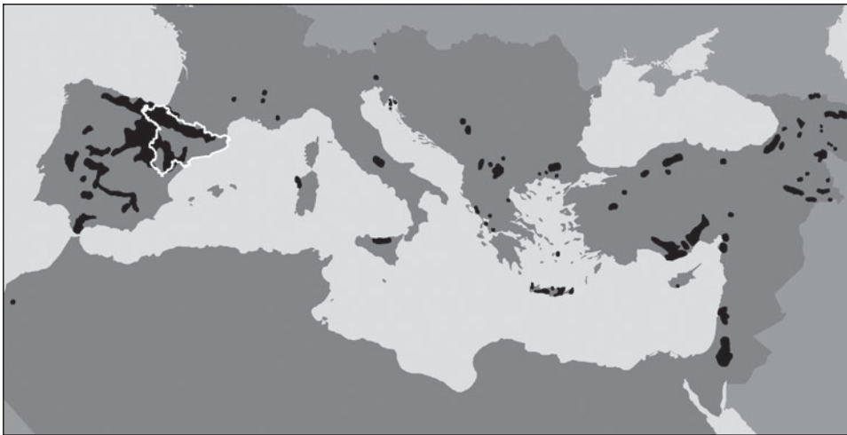
FIG. 1 Study area (encompassed by white line) and circum-Mediterranean distribution (shaded black) of the Eurasian griffon vulture Gyps fulvus population.