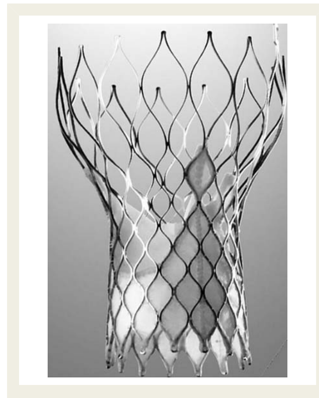
Figure | CoreValve prosthesis.