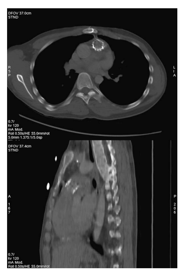
Fig. 2. A control computer tomography scan showing the implanted stent-valve (Sapien® valve, Edwards, Irvine, CA, USA) in the stenotic pulmonary conduit.

Surgery for right ventricular outflow tract reconstruction is necessary in case of pulmonary atresia and Tetralogy of Fallot, common arterial trunk and Rastelli operation in great vessels transposition and ventricular septal defect with pulmonary stenosis. However, although the survival of