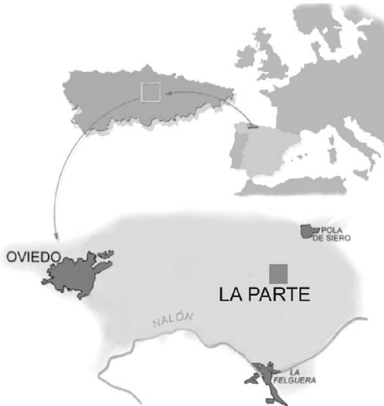
Fig. 1. Location of the Pleistocene La Parte (Asturias, Spain) paleontological site, within the framework of the Iberian and Cantabrian range, Nalón river and main towns.

materials and fossil taxa indicate not only a younger age but also different environmental conditions than the principal level. Nevertheless this upper level is not analyzed here. This study is focused on the La Parte lower level (level C), which is the layer that has yielded a faunal assemblage with cold-adapted elements (Fig. 2).