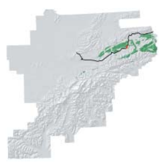
The dinosaur track was found in an outcrop of the Cantwell Formation near Igloo Creek (top photo and see red dot on map). The Cantwell Formation (green shading on map) is scattered across Denali's east end and is likely to harbor additional dinosaur fossils.

at the site, Fiorillo and Breithaupt bolted from the vehicle and sloshed across Igloo Creek for their first look. Then followed meticulous notetaking, measurements, and photography. Lying awkwardly on the rocky slope, Breithaupt carefully measured all the track's digits. Before photographing the track from all angles, he stuck black and white rulers to the rock around the fossil with sticky wads. This approach will yield three-dimensional computergenerated images that are used to analyze and compare this track to similar ones.