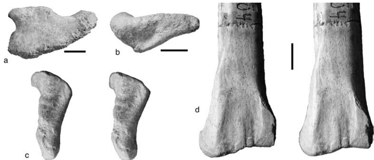
Figure 5. Isolated tibiae of small abelisauroids from the Late Jurassic of Tendaguru, Tanzania. (a, b) MB.R.1751 ('Coelurosaurier C' of Janensch, 1925). (a) Proximal view. (b) Distal view. (c, d) MB.R.1750 ('Coelurosaurier B' of Janensch, 1925). (c) Distal view (stereopair, slightly exaggerated to better illustrate morphology). (d) Anterior view of the distal end, illustrating facet for the ascending process of the astragalus (stereopair; exaggerated to better illustrate morphology). Scale bars are 10 mm.

sharply defined ridge extends from the lateral malleolus proximally and disappears some 11 mm proximal of the facet for the ascending process of the astragalus.