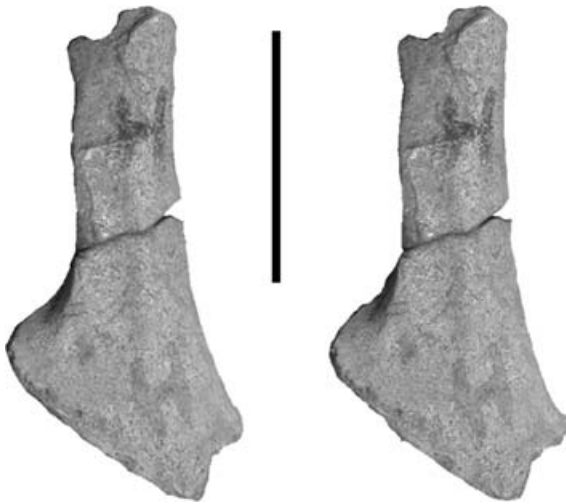
Figure 6. Distal end of a left ischium of an abelisauroid theropod from the Late Jurassic of Tendaguru, Tanzania; MB.R.1756. Lateral view (stereopair). Scale bar is 50 mm.