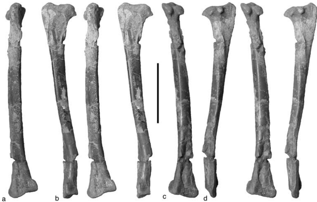
Figure 2. Isolated right tibia of a basal tetanuran theropod from the Late Jurassic of Tendaguru, Tanzania (MB.R.1763; 'Coelurosaurier A' of Janensch, 1925). (a) Anterior view (stereopair). (b) Medial view (stereopair). (c) Posterior view (stereopair). (d) Lateral view (stereopair). Scale bar is 50 mm.