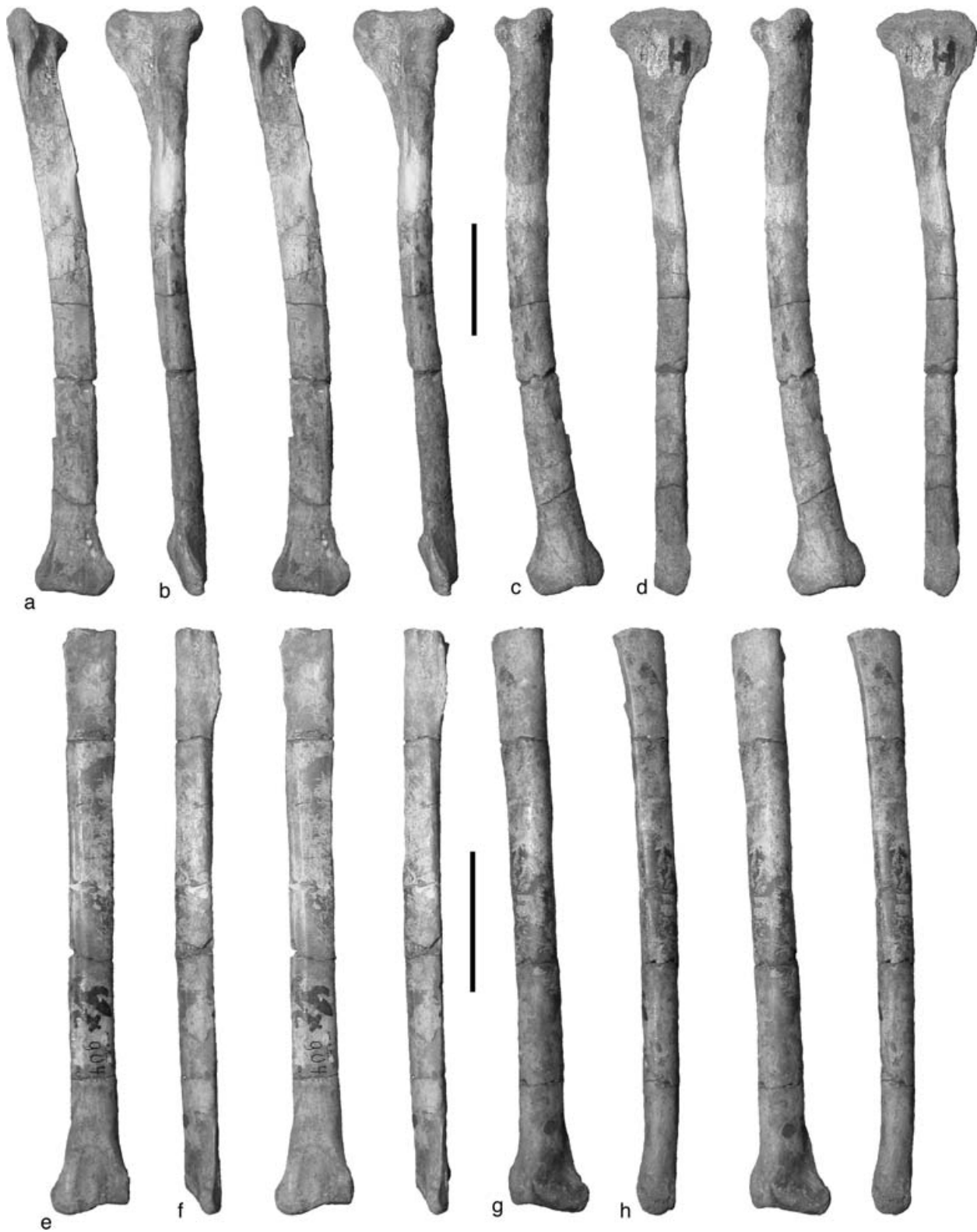
Figure 4. Isolated tibiae of small abelisauroids from the Late Jurassic of Tendaguru, Tanzania (top row: MB.R.1751; 'Coelurosaurier C' of Janensch, 1925; bottom row: MB.R.1750; 'Coelurosaurier B' of Janensch, 1925). (a) Anterior view (stereopair). (b) Lateral view (stereopair). (c) Posterior view (stereopair). (d) Medial view (stereopair). (e) Anterior view (stereopair). (f) Lateral view (stereopair). (g) Posterior view (stereopair). (h) Medial view (stereopair). Scale bars are 50 mm.