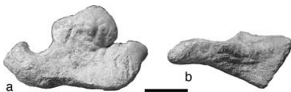
Figure 3. Isolated right tibia of a basal tetanuran theropod from the Late Jurassic of Tendaguru, Tanzania (MB.R.1763; 'Coelurosaurier A' of Janensch, 1925). (a) Proximal view. (b) Distal view. Scale bar is 10 mm.

posterior surface that is offset from the slightly convex anterolateral side by a pronounced edge, but curves more smoothly into the convex medial side. Distally, the shaft becomes anteroposteriorly flattened. The distal articular end is triangular in outline, with a higher medial part and a long, slightly posteriorly flexed lateral part (Fig. 3b). The lateral malleolus extends slightly further distally than the medial and is gently convex transversely distally. The medial malleolus is flattened distally. On the anterior side, an almost vertical step subdivides the proximal part of the distal expansion into two subequal sides and sharply flexes medially distally. This step represents the proximomedial bracing for the ascending process of the astragalus and thus indicates that this process was restricted to the lateral half of the astragalus. On the anterior side of the lateral malleolus,