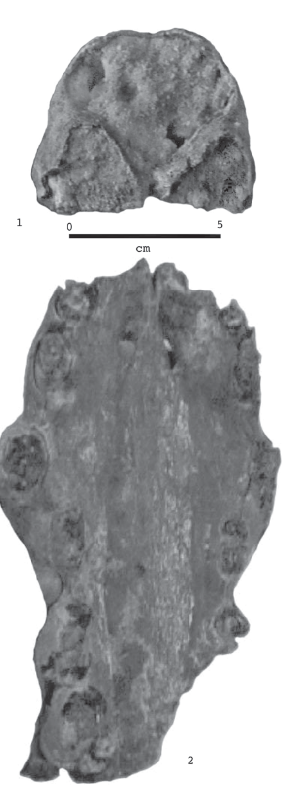
Plate 1.— Megalochoerus khinzikebirus from Gebel Zelten, base of the Middle Miocene, Libya.

An isolated lower molar (WUS B 10) consists of two sand-blasted fragments with a small area of contact that permits reconstruction of an almost complete tooth. The crown was completely formed