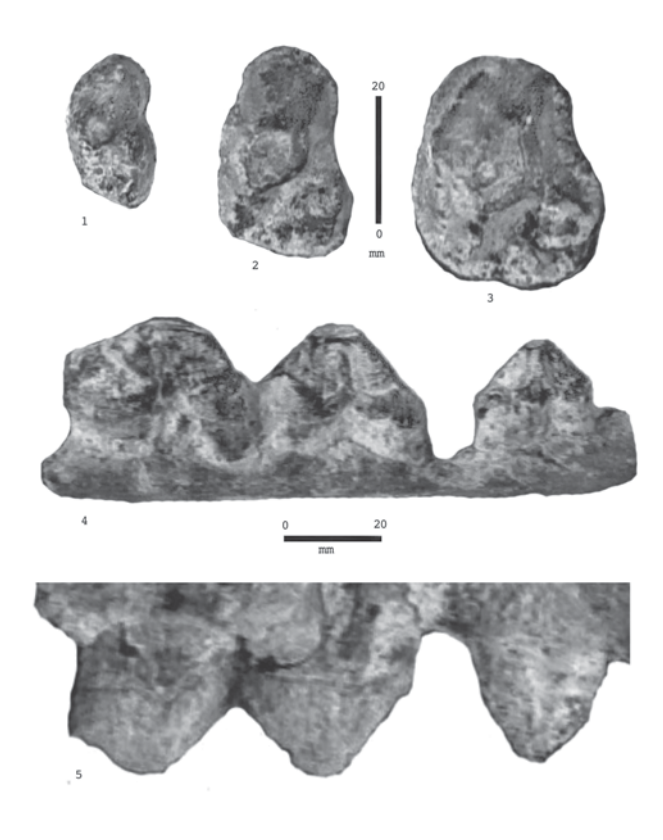
Plate 2.— Megalochoerus khinzikebirus from Gebel Zelten, base of the Middle Miocene, Libya.