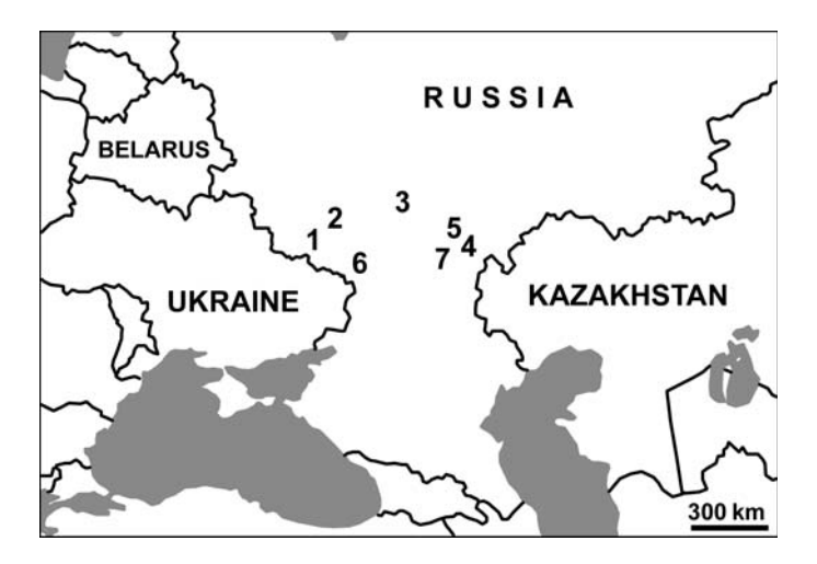
Fig. 1. Map of southern European Russia and adjacent territories showing mid-Cretaceous pterosaur localities in Russia: 1, Lebedinskii and Stoilenskii quarries; 2, Strelitsa; 3, Kobyaki; 4, Sinen'kie; 5, Saratov; 6, Pavlovsk; 7, Melovatka 3.

locality in the Volgograd Region (personal communication to the first author 2002).