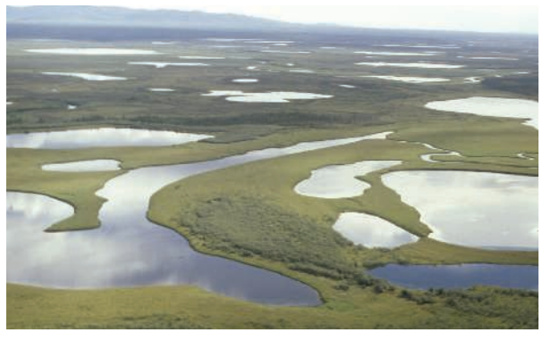
Pleistocene Park. This territory in the Republic of Yakutia is roughly an even split of meadow, larch forest, and willow shrubland. This Siberian region could become the venue for a reconstituted ecosystem that vanished 10,000 years ago.

In northern Siberia, mainly in the Republic of Yakutia, plains that once were covered by tens of meters of mammoth steppe soils now occupy a million square kilometers. The climate of the territory is