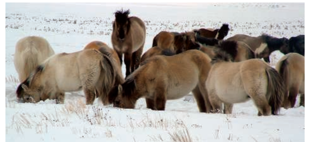
Horse sense. Grazing on a snow-covered tundra meadow in northern Siberia, rugged Yakutian horses like these could help reduce the effects of global warming by stabilizing vast expanses of grassland.

Yet, these great herbivores disappeared by the millions from northern Siberia and elsewhere. As has happened elsewhere and at other times, their vanishing coincides with