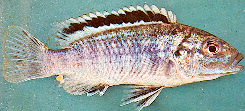
Pseudotropheus U-1 or opaline cichlid from Likoma Island, Lake Malawi. Male in breeding color.