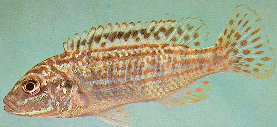
Pseudotropheus U-1 from Likoma Island, Lake Malawi. Female.