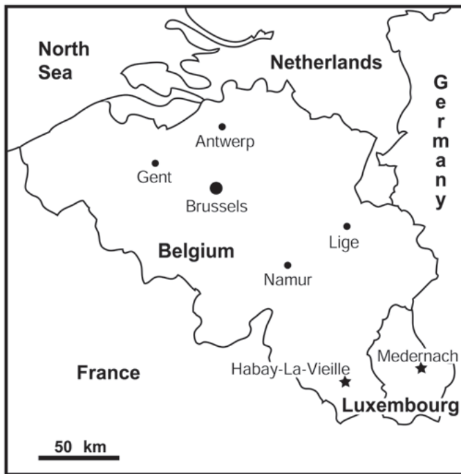
Fig. 1. Location of the fossil sites Habay-La-Vieille in southern Belgium and Medernach in Luxembourg (Lorraine). The localities indicated by asterisks form the NE extension of the Paris Basin.

cate, without illustrations, a single tooth in the Upper Triassic of Saint-Nicolas-de-Port in France, which is also assigned to pycnodonts. Isolated teeth from Aust Cliff in Southwest England may also represent pycnodont remains (G. Cuny, pers. comm. 1997).