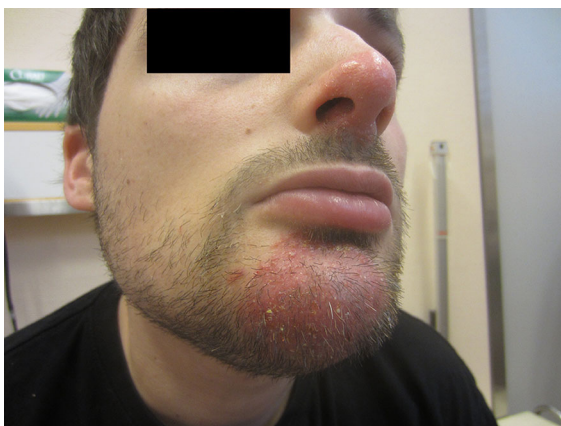
Fig. 1 Tinea barbae with A. vanbreuseghemii

Culture assay for 7 days at 32 °C on Sabouraud’s agar medium produced a growing fungus with a white to beige powdery surface attesting to the production of