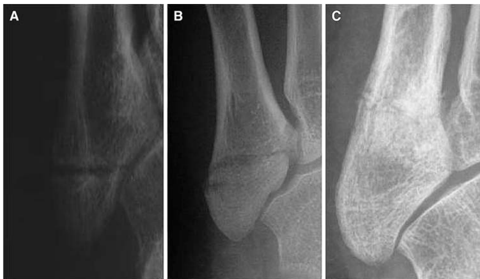
Fig. 1 Classification of proximal fifth-metatarsal fractures. a Avulsion fracture of the tuberosity. b Jones fracture (metaphyseal fracture). c Proximal diaphyseal fracture

screw and changings of the midfoot architecture or secondarily due to pronation strength changings, like a functional pes varus.