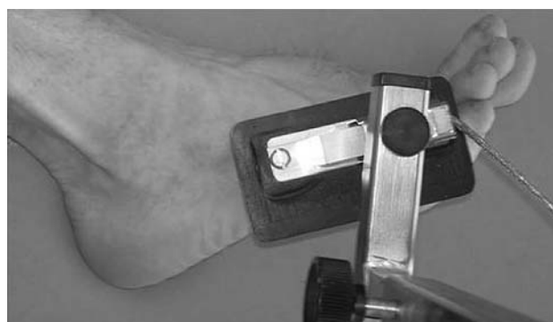
Fig. 3 Muscle strength measurement. The picture shows strength measurement of maximal eversion power (peroneal muscles)

Gait pattern and plantar pressure distribution were analyzed by using the NOVEL dynamic pedobarography