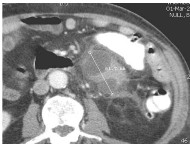
Fig. 1. Computed tomography scan of diverticulitis stage Hinchey II. A 6 × 4-cm pus collection of diverticular origin is demonstrated in a 56-year-old man who presented with fever, leucocytosis, and pain in the left iliac fossa.

Immediately after catheter placement, a syringe is inserted, and the fluid collection is aspirated until the flow ceases. The pus then is sent for bacteriologic analysis. After aspiration, the catheter is left in place