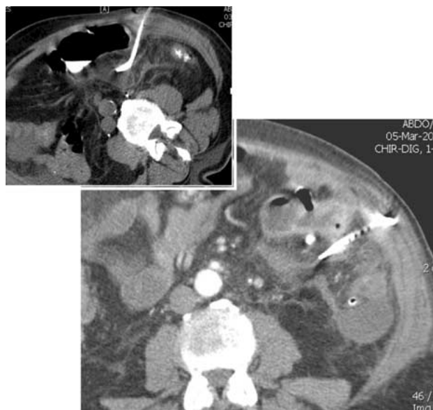
Fig. 2. Percutaneous drainage of diverticular abscess guided by computed tomography (CT) scan. A large pigtail catheter was placed under CT scan guidance inside the fluid collection, and 20 ml of pus was aspirated ( below ). Control 3 days later shows complete resolution of the abscess. The drain was removed the next day.

to allow gravity drainage, and its adequate position subsequently is verified with additional imaging. The interventional radiology team and the surgical staff jointly perform patient follow-up evaluation.