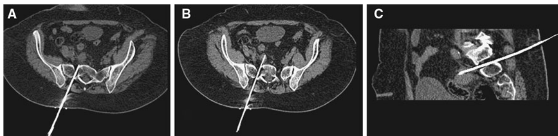
Fig. 2 A CT control after carefully advancing the needle through the S1- neuroforamen after application of a minimal amount of local anesthesia at the dorsal ostium to avoid nerve root block. To obtain

The cytological and histological assessment of suspicious mass lesions is mandatory to allow potential tumor staging and therapy planning. Small lesions in the upper presacral space can be challenging for needle biopsy, because they are difficult to impossible to reach via a caudal or lateral approach. In those cases, and if in the effective direction, a transneuroforaminal approach is an alternative. The sacral transneuroforaminal approach is a common technique for electrical nerve stimulation for bladder dysfunction or