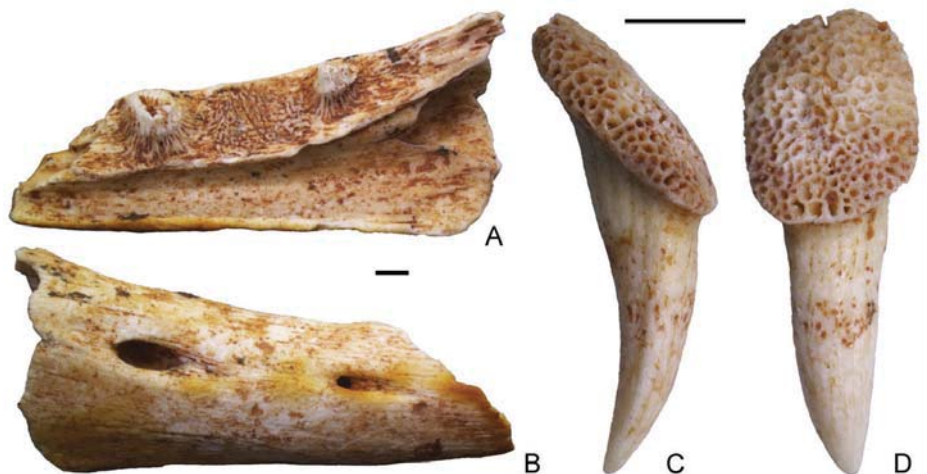
FIGURE 2. Varanus sp. Right dentary (UU TB5 1002) in A , medial and B , lateral views; isolated tooth (UU TB5 1003) in C , medial and D , labial views. Scale bars equal 1 mm.

enamel at the basal portion of the tooth) are typical features of the clade Varanoidea (e.g., Estes, 1983; Bailon, 1991; Kearney and Rieppel, 2006; Pianka et al., 2004; Luan et al., 2009). Moreover, certain features of the new Greek material exclude its referral to the non-varanid varanoids (helodermatids, necrosaurids, and lanthanotids). In Heloderma , striae due to the development of plicidentine are less extended towards the tip of the teeth in comparison with Varanus (Kearney and Rieppel, 2006). In addition, the spongy tissue at the tooth base of helodermatids does not fully close the pulp cavity, as it does in Varanus and in the isolated tooth described herein (Kearney and Rieppel, 2006). In Lanthanotus , striae are less developed towards the tip, whereas the shapes of the teeth, maxilla, and the dentary are very different than those of the new fossil material (McDowell and Bogert, 1954; Kearney and Rieppel, 2006). In necrosaurids, the presence of plicidentine is highly probable, but the anatomy of the maxilla and the dentary, and dental shape, is distinct (Augé, 2005; Augé and Smith, 2009). Moreover, in terms of the