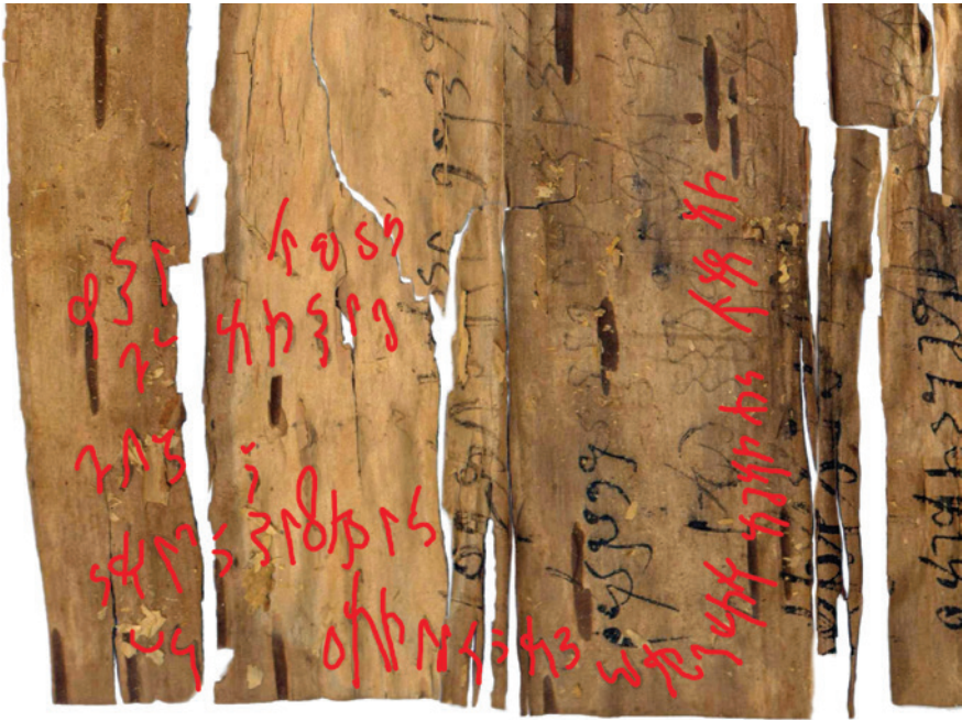
Fig. 2: Detail of the obverse of BajC 1 with inserted text highlighted.

As expected for the version on the obverse, the text of this rule basically corresponds to the text of the Theravāda Prātimokṣasūtra