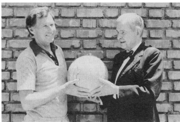
FIG. 2. Two World Campaign for The Biosphere leaders symbolically supporting 'the globe' in Srinagar, India, June 1984. The modern brick wall is also symbolic: when a situation is allowed to deteriorate to the extent that it becomes biospherical, people are virtually backed against a wall. So why the smiles? Because the Campaign is in action, and people in more and more regions and walks of life are talking about The Biosphere and relating their lives to it as the sole life-support.

is left to Nature's ways of shortage and deprivation, famine and/or pestilence, and to Mankind's own way of increasing violence and slaughter. Yet, this ever-worsening situation has to be remedied if our World is not to deteriorate further and further into a plethora of dreary monocultures and widespread squalor. Of the need for proper remedy, environmental education and due awareness should at least provide an overview warning, while pointing the way widely to stewardly care and ultimate amelioration—hence the new WCB-ISEE dual establishment to carry on the World Campaign for The Biosphere as explained by Davis (1983).