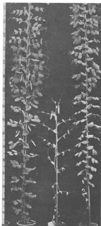
Fig. 3. Three photo-dependent response types in peas. Left (G2-type): reproductive phase is initiated early, but apical growth continues despite irregular production of fruits and seeds. Note presence of flowers at apex and fully mature fruits near base. Center (K-type): flower initiation is delayed but, once begun, normal reproductive activities lead to rapid senescence and plant death. Right (G-type): flowering is inhibited; plant remains vegetative. All plants grown under short day conditions.

trating the effects of the genotype and the environment upon senescence the results of only one cross are presented here.