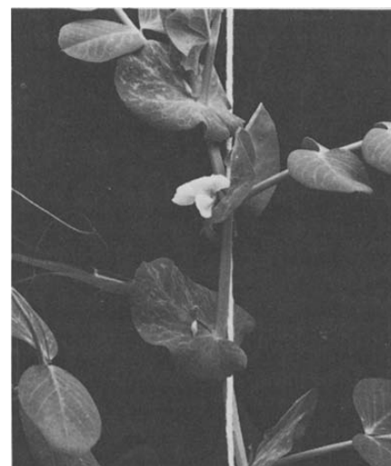
Fig. 2. Portion of plant cultivated under natural short days in greenhouse showing G2-type response. Abortive flowers appear above and below normal flower.

From a cross between the G- and the I-lines we have recovered still another